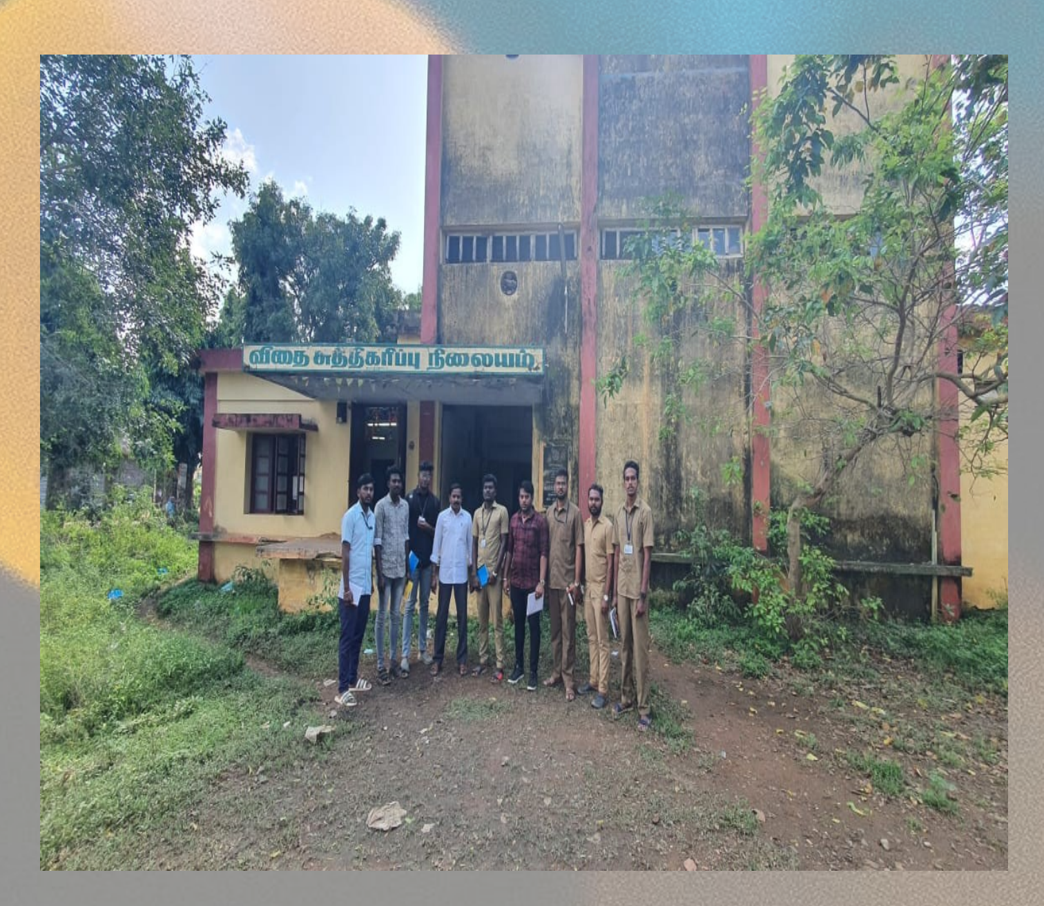
Seed Treatment Station

Students of School of Agriculture, PRIST during A 'Knowledge Exchange' Event with the local officers of 'Seed Treatment Station', Department of Agriculture, Govt. of Tamil Nadu.