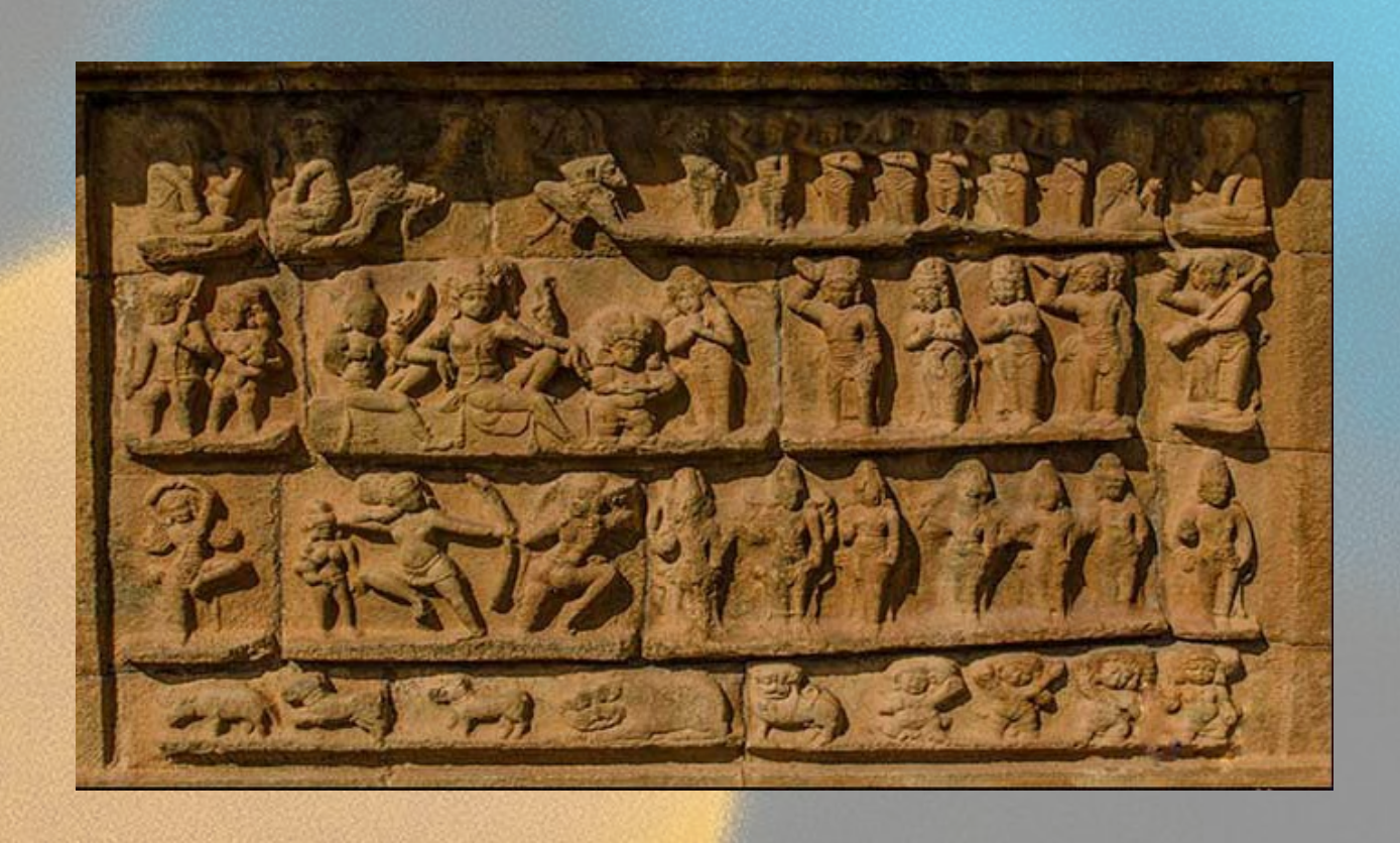
Pragadeeswarar temple sculptures