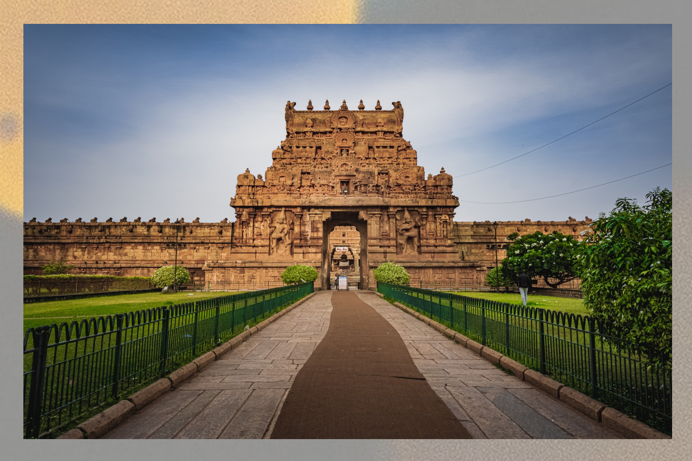
Pragadeeswarar temple -Indian Knowledge System (IKS)

Emphasises on the promotion of IKS. PRIST has, in this connection, a distinctive advantage. Faculty members organize periodically visits to the historical monuments present in the vicinity of the campus. Some of these monuments include, Pragadeeswarar temple, Thiruvaiyaru Thiagaraja memorial place etc.. The IKS aspects advocated in the new educational policy are addressed by such planned educational visits of various groups of students