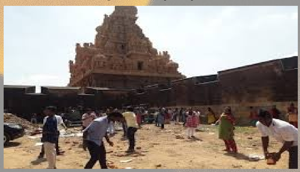
Pragadeeswarar temple – Thanjavur Indian Knowledge System (IKS)